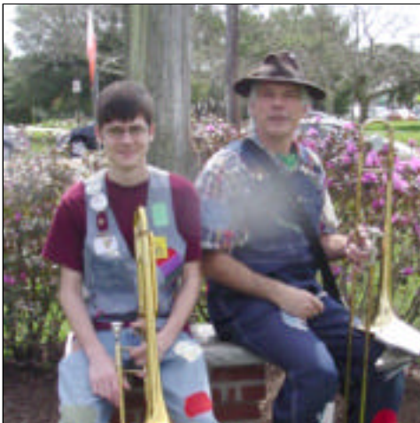
Father and son 'bones