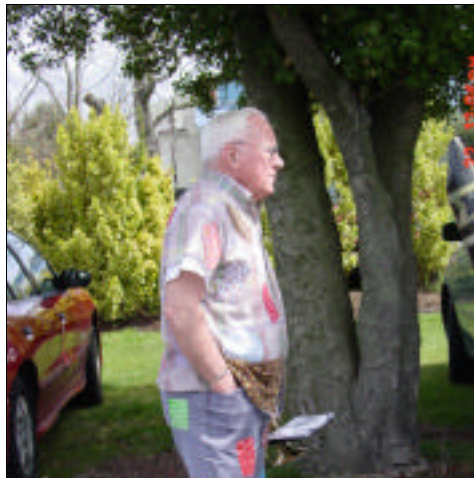
Where's the parade?