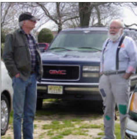
"Don't come any closer..."