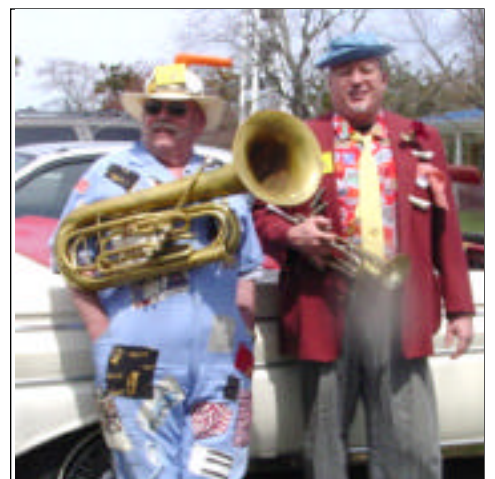
Big horn, little horn