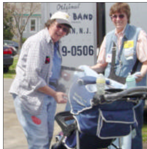
Hey! It's a family affair!