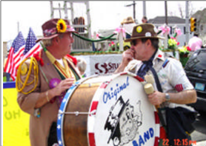
Are ya gonna talk to me or blow yer nose?