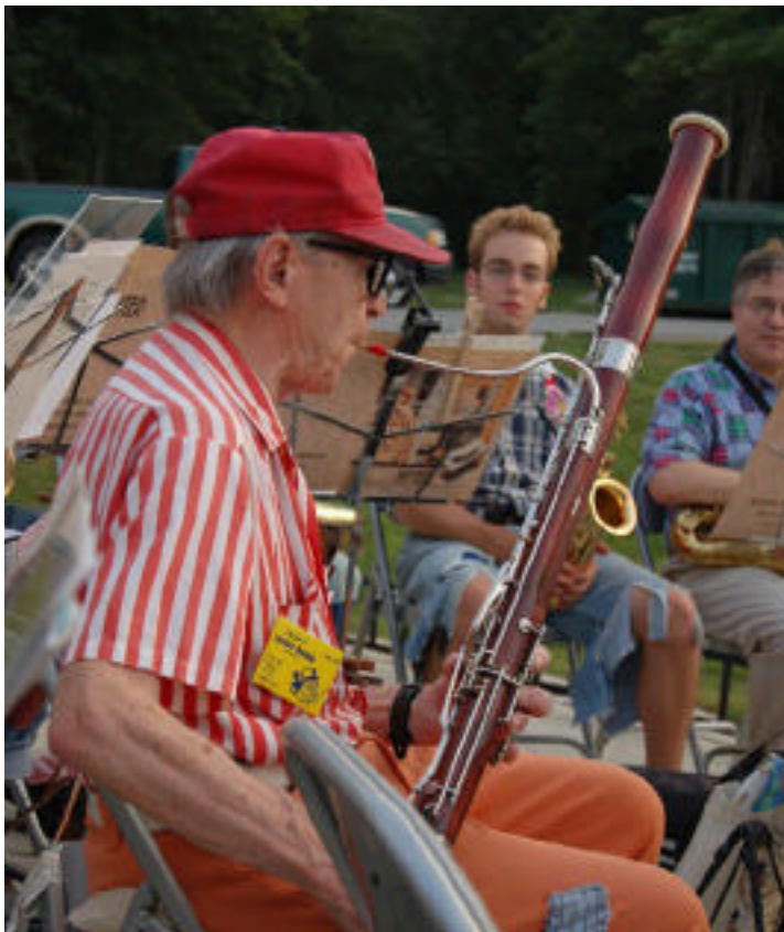
Look, Louie, see how easy it is!