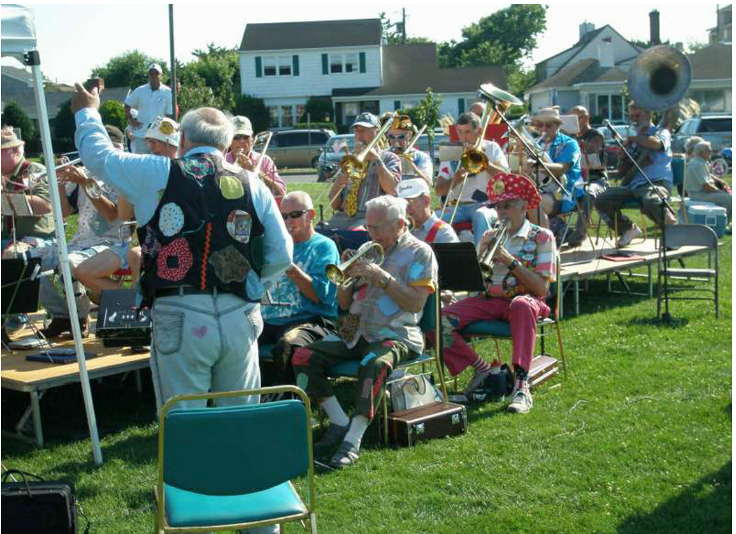
The Original Hobo Band, doing what they love to do. Taa-daaah!

Please check the Web site or Calendar Board in Hobo Hall for the latest parade / concert engagements.