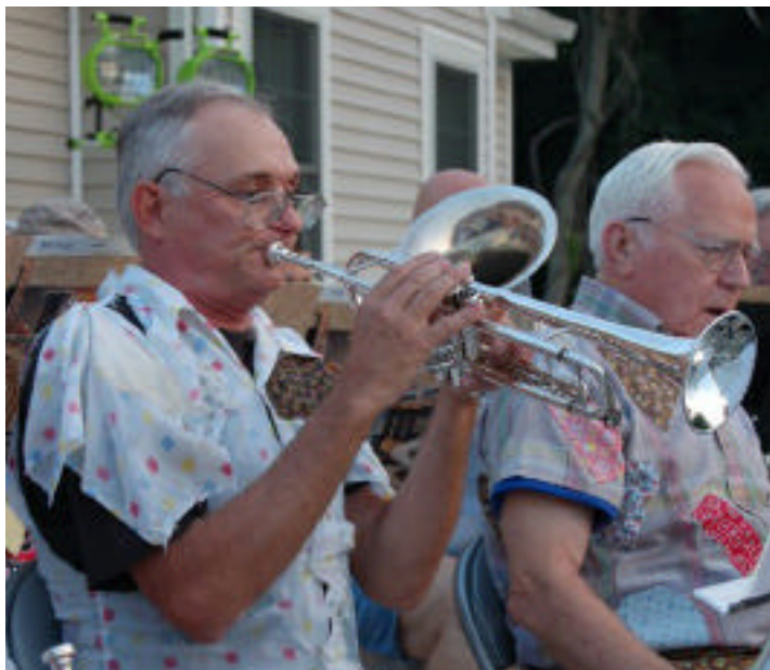
I just wanna see how long I can hold that note...