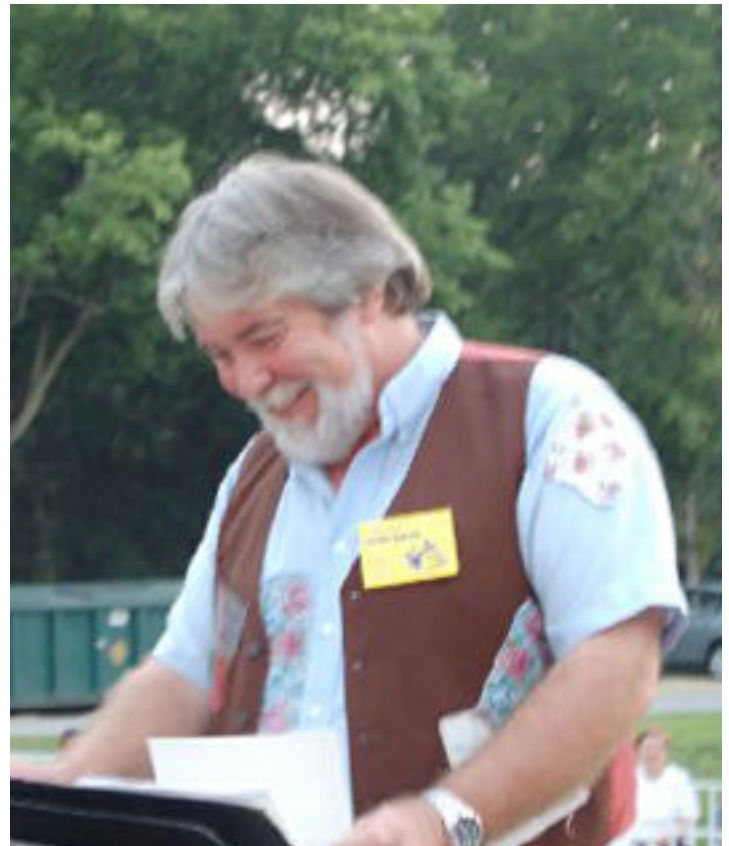
Looks like a Humoresque...sounds like _____