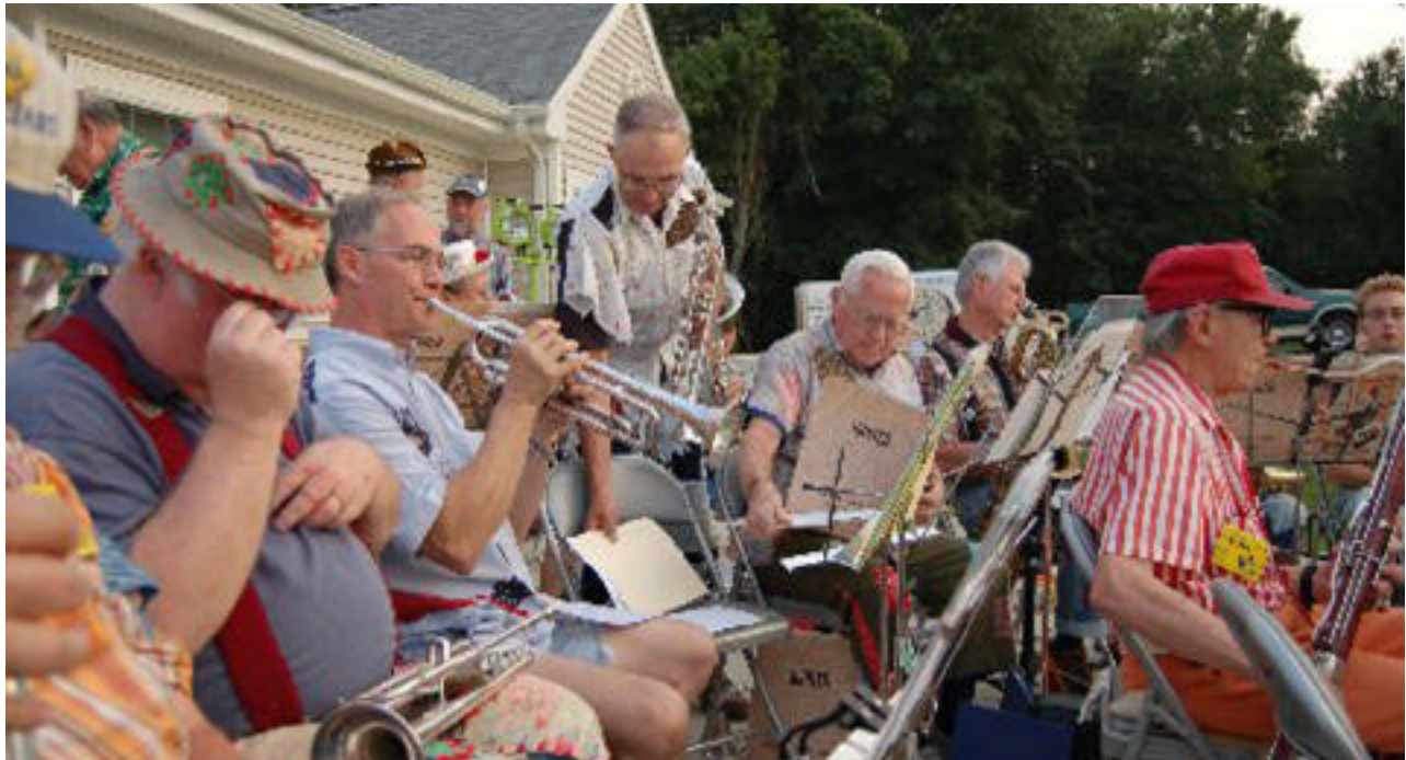
That was so pretty I got verklempt!